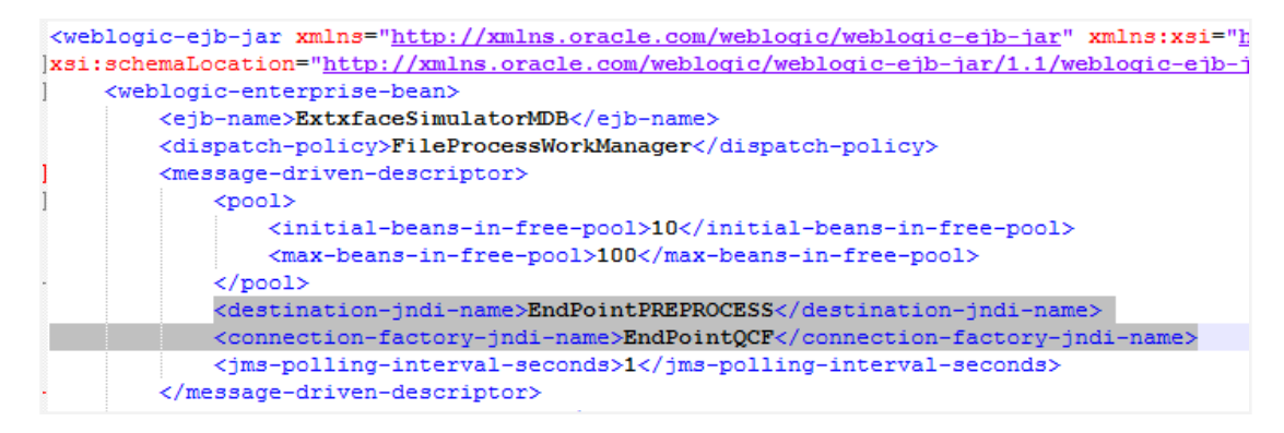
Fig. 2.0 [weblogic-ejb-jar.xml]

The WebLogic Server weblogic-ejb-jar.xml deployment descriptor file describes the elements that are unique to WebLogic Server. Configuration of queue details, which mdb listener listen are mentioned here.